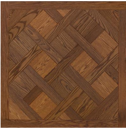
TABLEAU by adler | Type A Oak Loire | classic | brushed | oiled