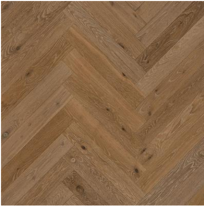
ELÉGANCE 600 by adler | Oak "Paris" (Herringbone 90°) | classic | brushed | oiled Item No. 07-000651