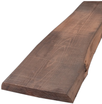
Bouls Black Locust steamed 40 mm