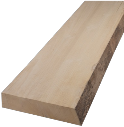
Bouls Ayous 52 mm