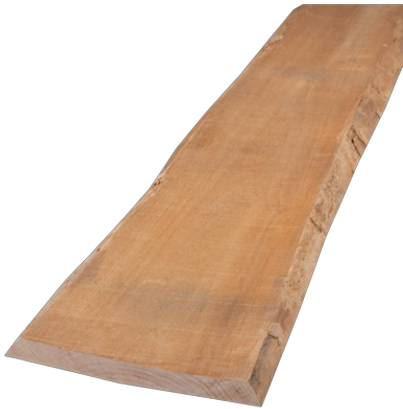
Bouls Maple 26 mm